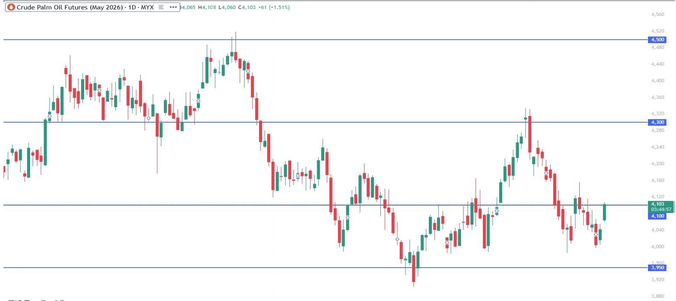
Chart of the Day - Crude Palm Oil Daily Chart