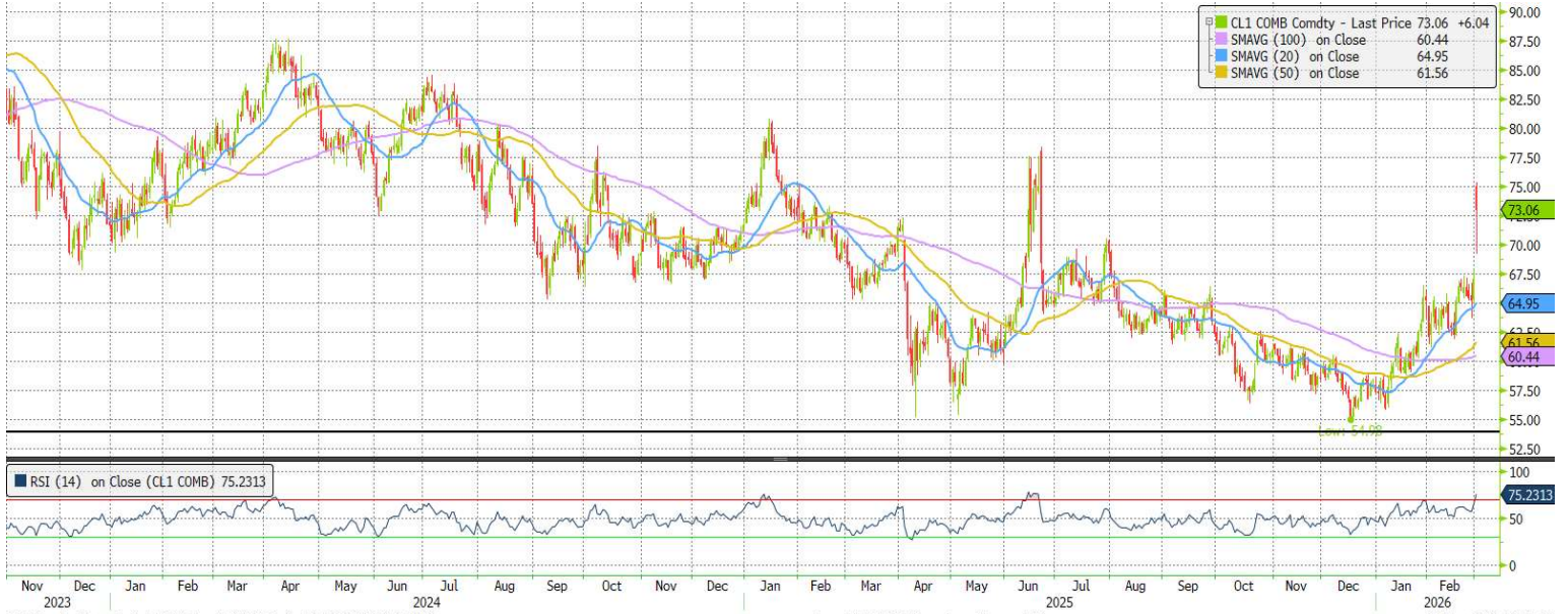
Chart of the Day - Crude Oil Daily Chart

CL1 Comdty (Generic 1st 'CL' Future) JIAHUI Daily 31OCT2023-02MAR2026